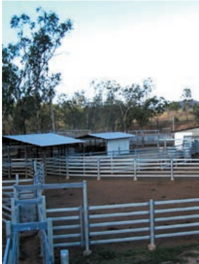
Facilities and equipment need to be designed and maintained to minimise risks to livestock welfare