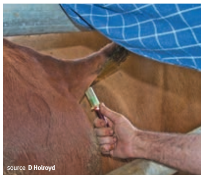
Tail bleeding for disease investigation