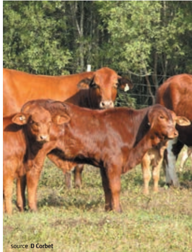
Cows and calves in healthy condition