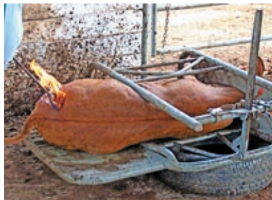
Husbandry procedures must be done in a manner that minimises the risk to livestock welfare