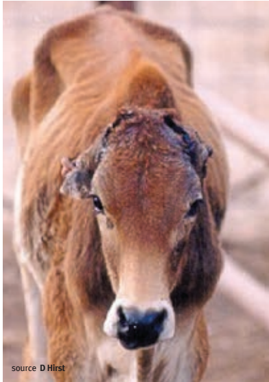
Calf attacked by wild dogs