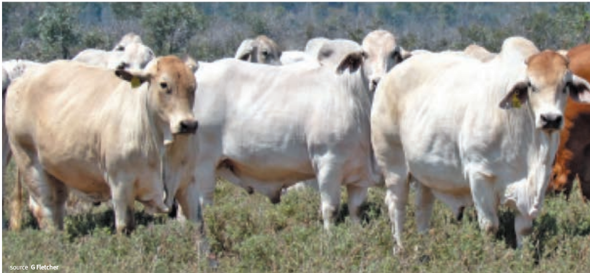
Japanese Ox bullocks in central Queensland