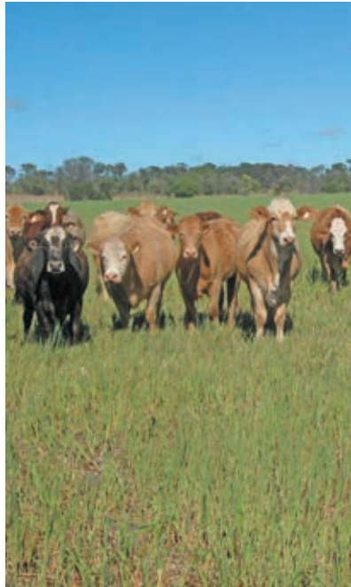
Bullocks being fattened on oats