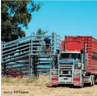
All people involved in transporting cattle share responsibility for minimising risk factors