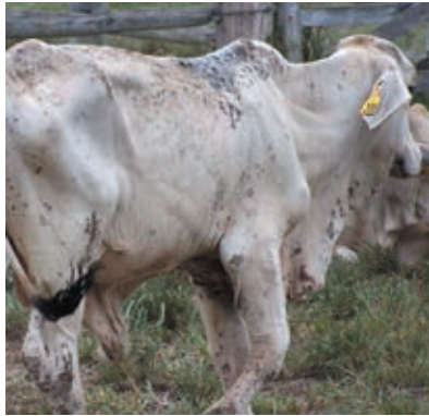
Steer suffering from external parasites