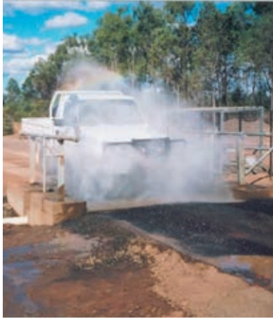
Vehicle washdown to prevent spread of weeds