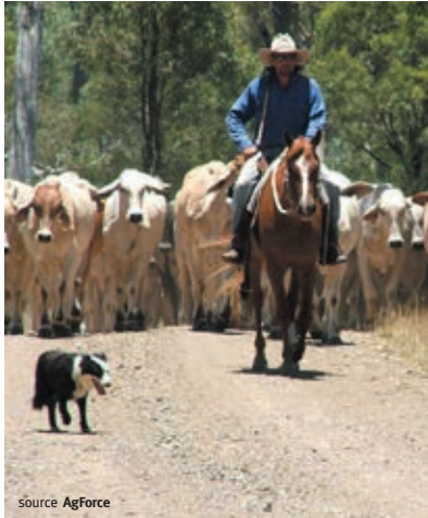
Livestock should be handled quietly and calmly, so as to minimise stress during handling