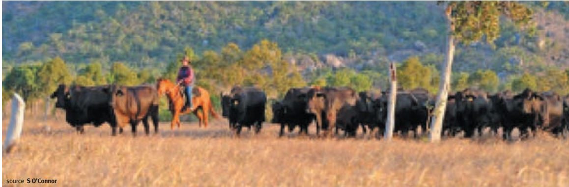
source 5 O'Connor Cattle being settled into their new paddock after travel