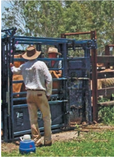
Females being pregnancy tested for herd management

A person performing artificial breeding procedures on cattle must take reasonable precautions to minimize pain, distress or injury. These procedures include artificial insemination, oocyte collection, embryo transfer, semen collection and pregnancy diagnosis.