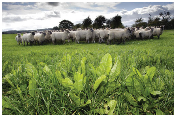
Figure 3 Sheep grazing chicory

The tannin content of plants varies considerably between plant species and genotype. It may also depend on stage of plant growth, and can vary with plant part (leaf, stem, inflorescence, and seed), season of growth and factors such as