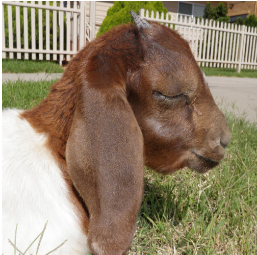
Figure 2. Bottle jaw (sub-mandibular oedema) can indicate severe infection by both barber's pole worm and liver fluke.