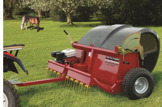
Figure 4 A pasture 'sweep and collect' manure collector.

Research into dung beetle activity and their effects on reducing parasite larvae has shown mixed results. Some showed that burial of dung helped larvae to live longer and that protection